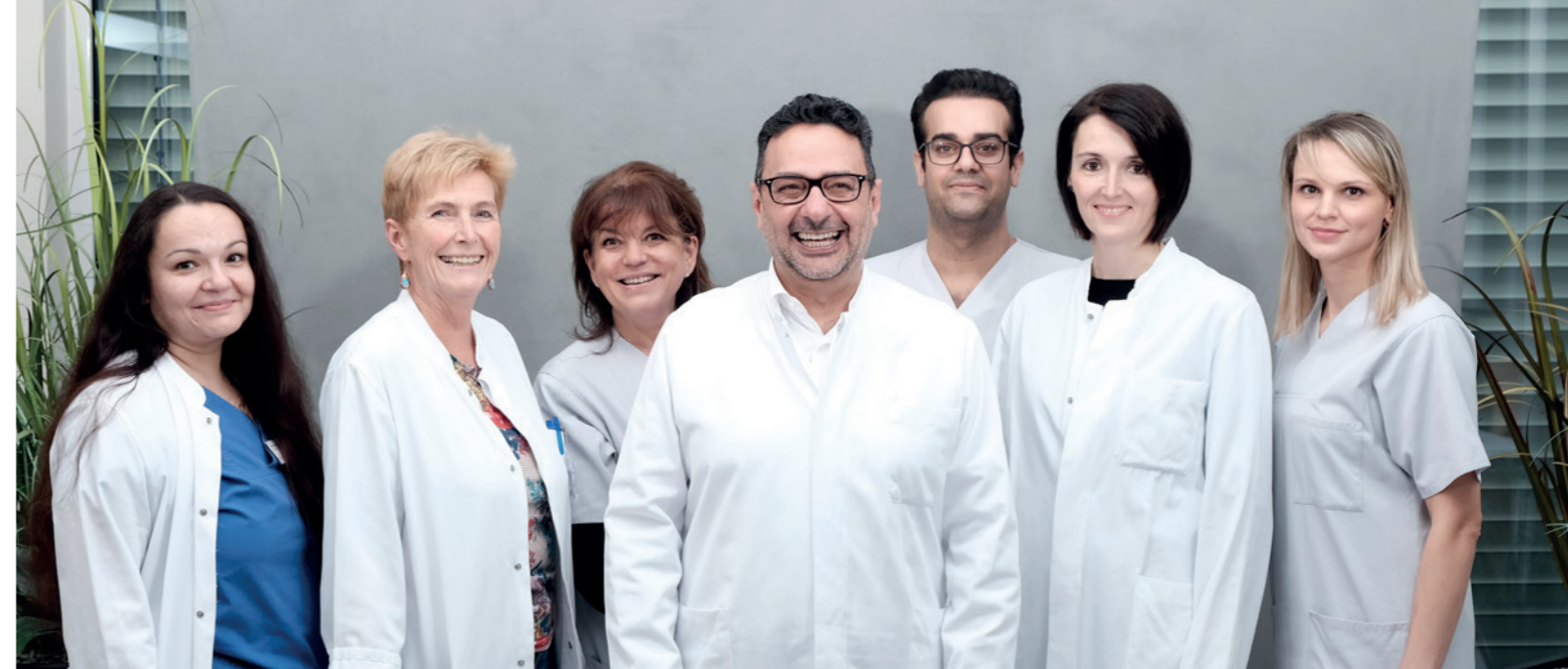
The Department of Gynecology and Obstetrics' physician team

I absolutely wanted to be a surgeon. During my practical year I was able to experience the broadness and great variety of gynecology. During this time, I chose this specialty and I've never regretted the decision since. It's an interesting and challenging discipline which continues to evolve, and I enjoy attending continuous education courses and learning new techniques and standards to stay up to date. At the time when I was trained, I had to master everything in all areas. This was an advantage because I was able to take on leading roles early on. Some of my favorite disciplines then emerged over time.